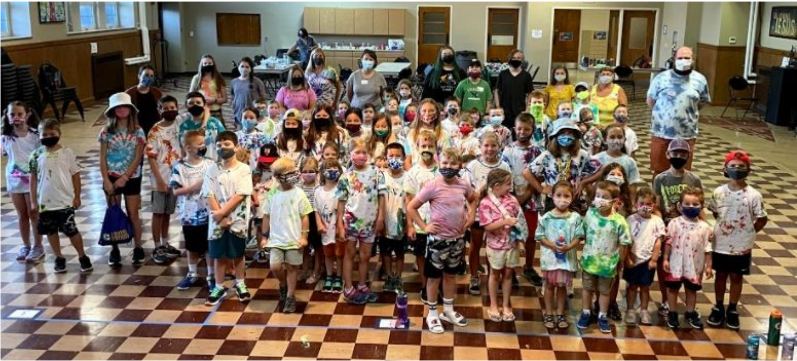
New Creation Art Camp was held June 21—June 25. Approximately 80 children and about 2 dozen volunteers spent the week creating, singing, learning, and playing. What a fun week!