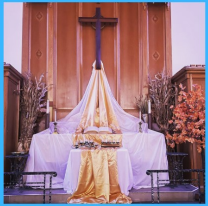
The Altar Decorating Crew has been hard at work creating beautiful views in the Sanctuary.

Then, on Christmas and New Year’s Day, we will gather in our chapel for music, communion, and reading of Jesus’ birth. We are anticipating a warm, intimate gathering of those who desire to honor these significant days with the centering thought “This, this is Christ the King!” And may this refrain echo throughout 2023 as beyond the season of Advent we commit daily to drawing close to God in simple, elegant, invitational ways. Holy Christmas to all!