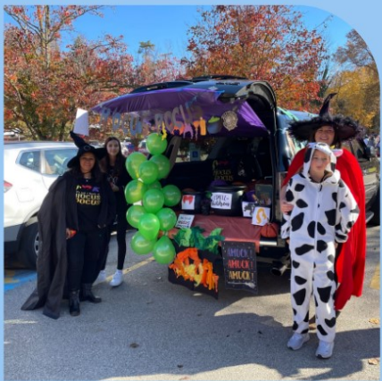
Trunk or Treat was a tremendous success. With food trucks, a costume contest, and music by the Praise Band, fun was had by all.